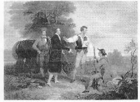
Artworks by three different artists titled "The Capture of Major John Andre."

A LIGHT LUNCHEON WILL BE PROVIDED. COST: $5 PER PERSON. (PAY AT THE DOOR.)