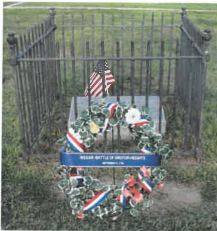
BGH 2019 Pic3.jpg