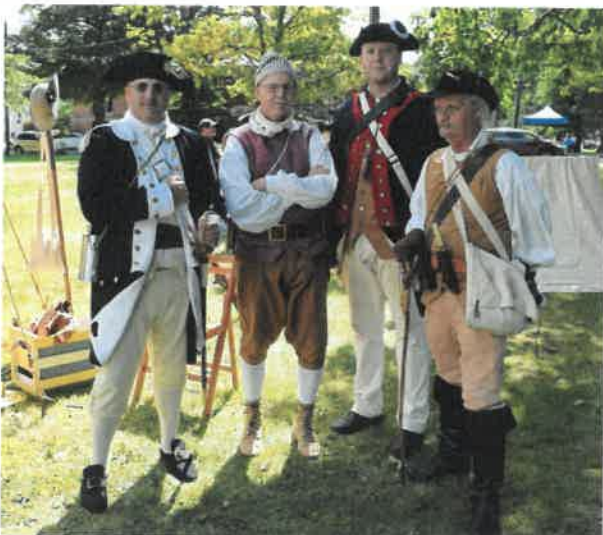
L300 2019 Pic4.jpg