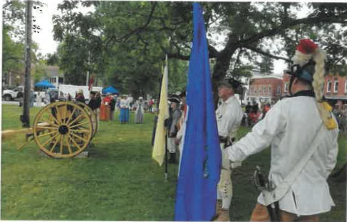
LFR 2019 Pic4.jpg