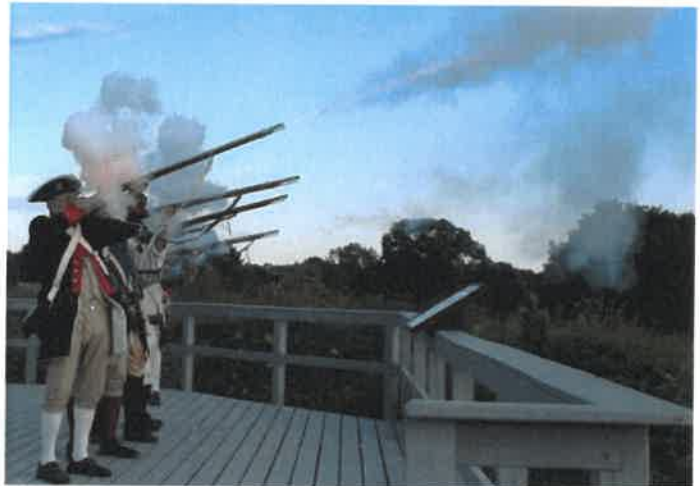
BGH 2019 Pic4.jpg