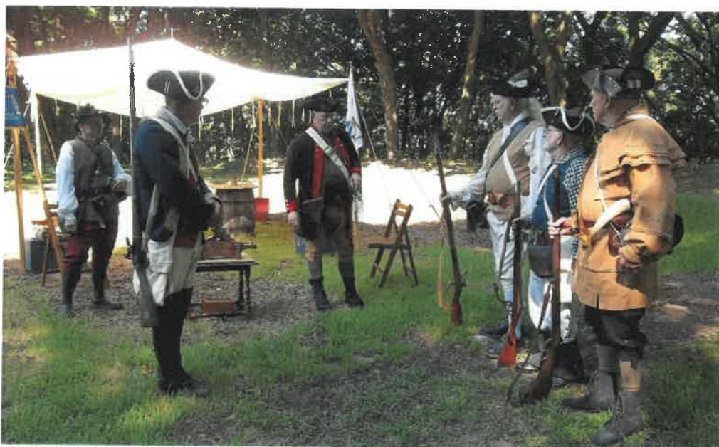
IVNH 2019 Pic2.jpg