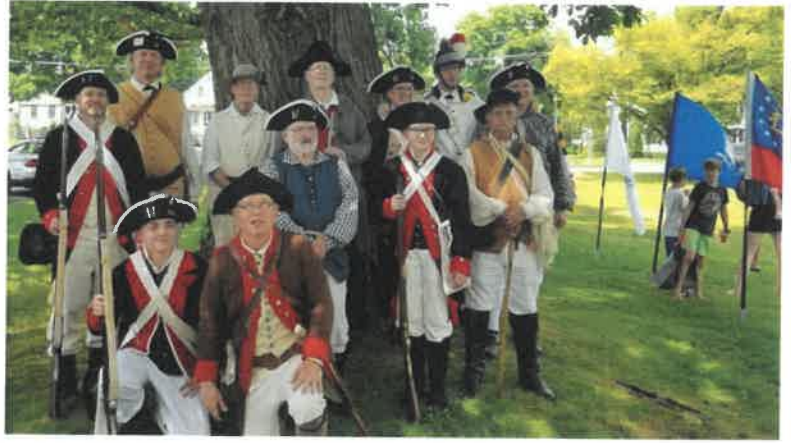
LFR 2019 Pic3.jpg